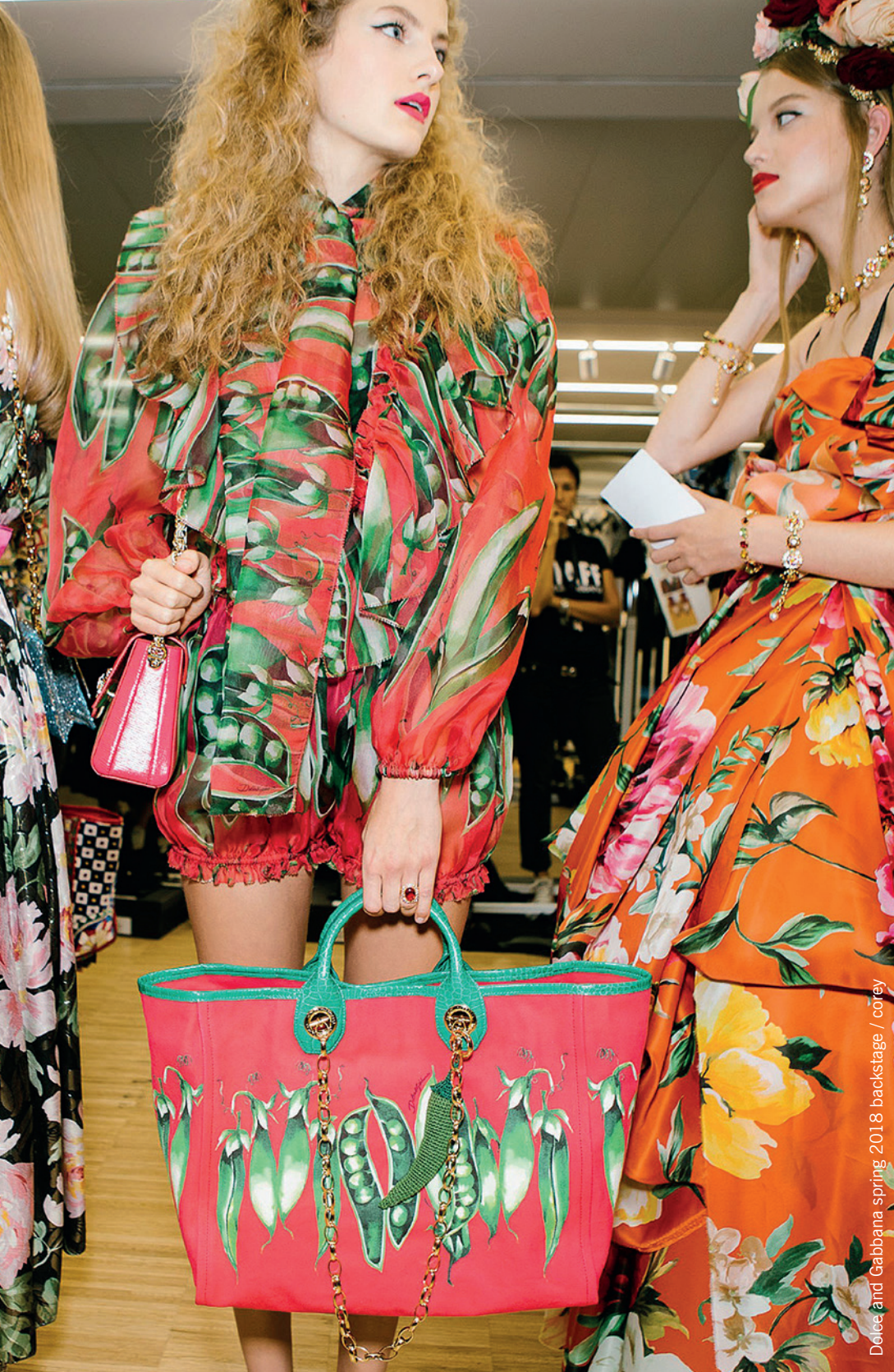
Dolce and Gabbana spring 2018 backstage