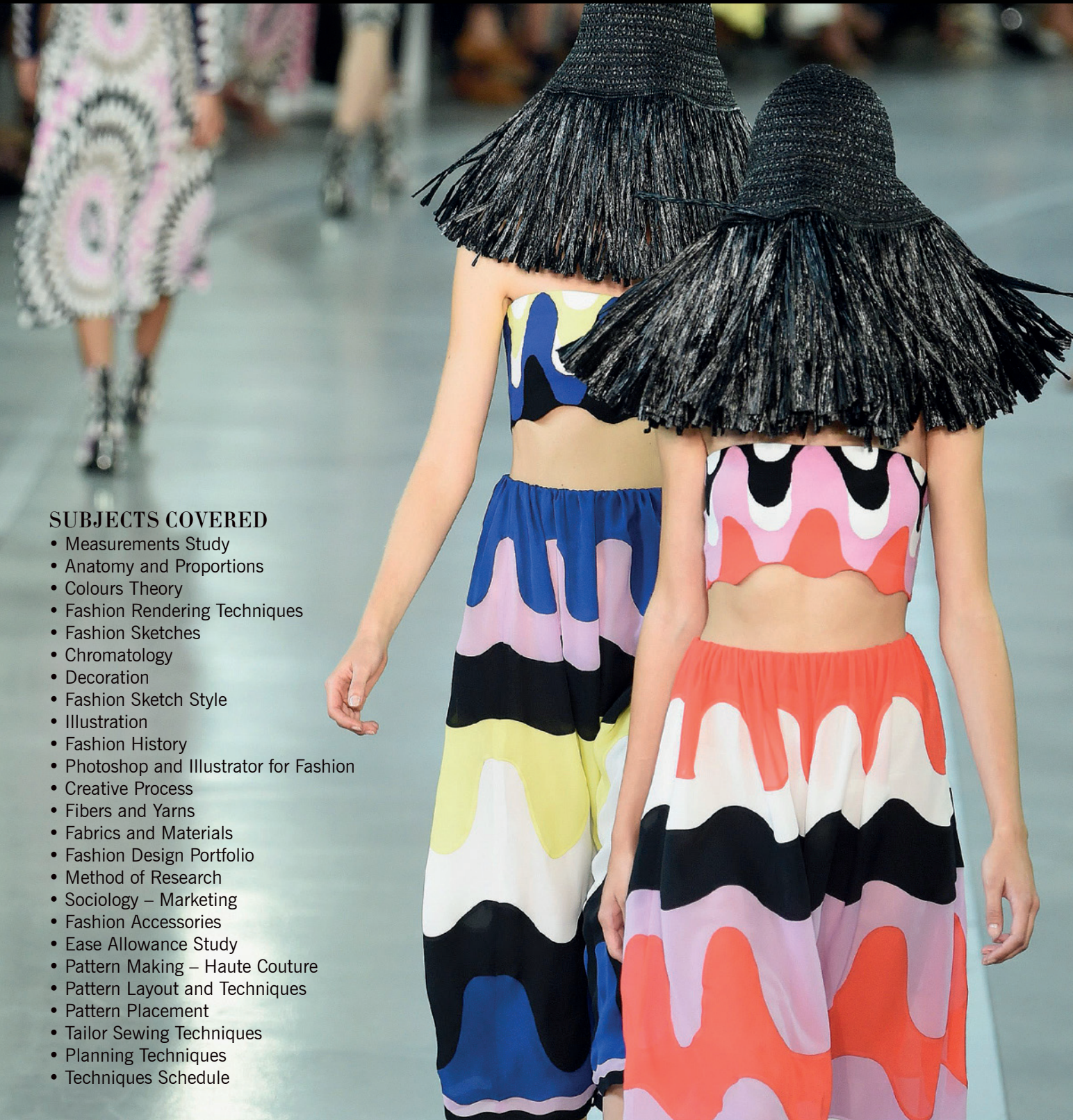
Emilio Pucci Spring/Summer 2017

Swiss Mode was created with the intention of transforming its students into real fashion artists. Thus, each student is shown how to reconcile his individual imagination with professional workplace requirement. To become a fashion stylist means to be able to express a concept and implement it in terms of fashion. As a part of this process, it is necessary to know something about clothes, coloring techniques, manufacturing and most importantly how to give form (style) to an idea knowing that it can be realized. For this reason, stylism has put together most of Fashion Design courses, Pattern Making and Dressmaking subjects. A real stylist will have to acquire skills related to the entire production cycle: from the creative process to the finished product.